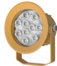
Docklights MSRP: $152