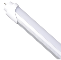
Tubular LEDs MSRP starting at: $10