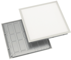
Backlit Flat Panels MSRP: 2x2 $72; 2x4 $90