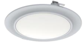
Downlights MSRP starting at: 4" $58; 6" $72