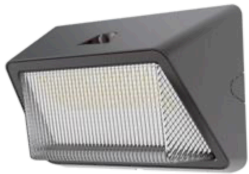
Wallpacks MSRP starting at: $94