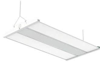
Highbay Fixtures MSRP: 2x2 $160; 2x4 $220