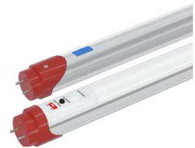
Emergency Backup T8 MSRP: $138