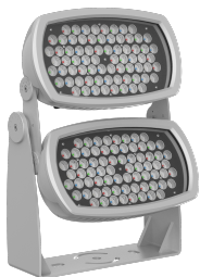
RGBW Facade Fixture Ask for pricing