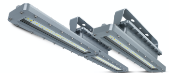
Hazardous Location Fixtures Ask for pricing

Looking for something that isn't here? Give us a call; we have a variety of designs to suit your project needs.