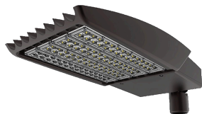
Pole Lights MSRP starting at: $240