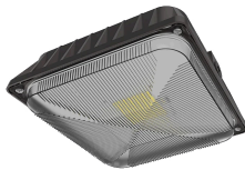
Garage Lights MSRP starting at: $105