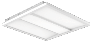
Architectural Troffers MSRP: 2x2 $135; 2x4 $175