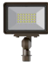
Flood Lights MSRP starting at: $54