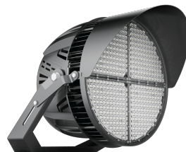
Stadium Lighting MSRP starting at: $450